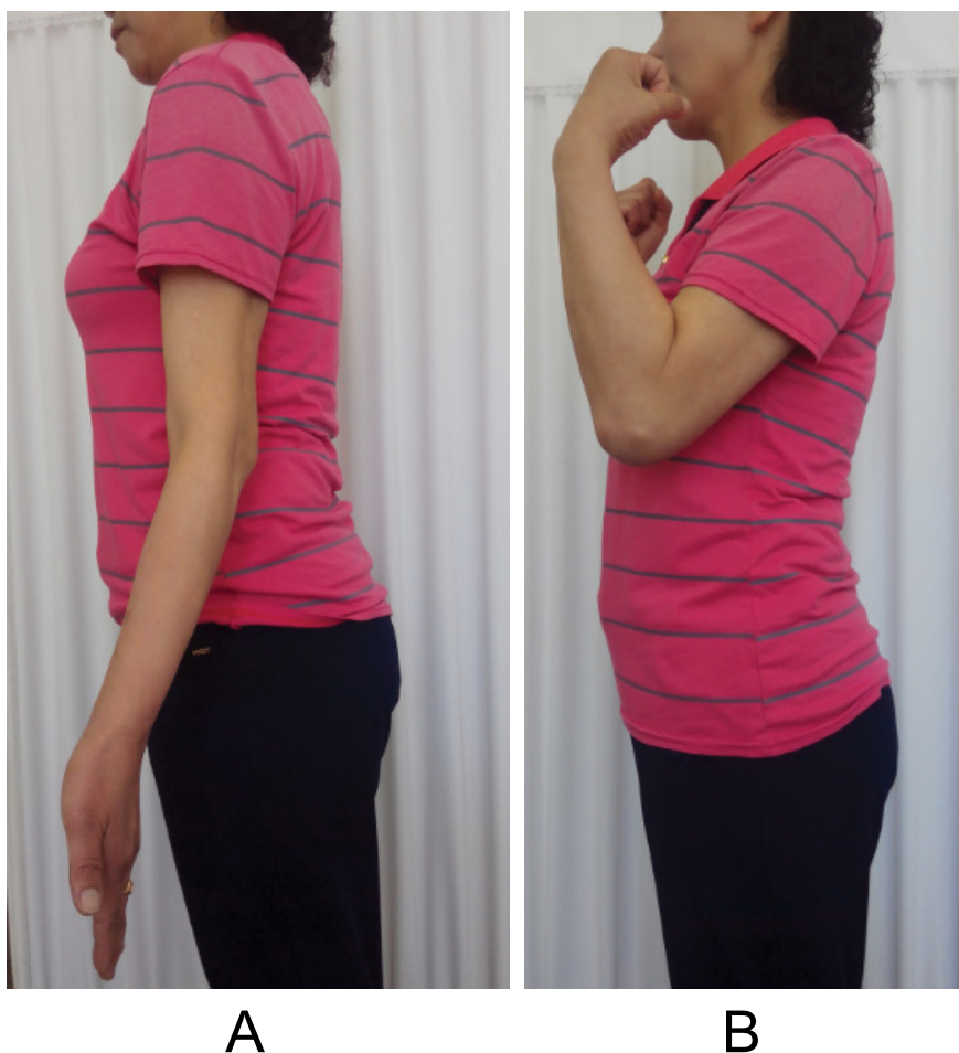
Figure 5: Recovered functional arc of the elbow (a) Extension loss is approximately 20 degree; (b) Flexion is approximately 130 degree.

The most common cause of HO is trauma such as