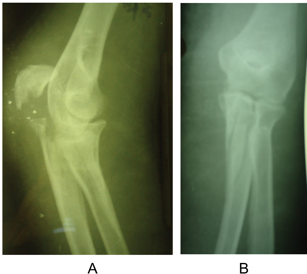
Figure 1: Preoperative X-ray view of the patient sustaining an intra-articular, comminuted, fracture of the left proximal ulna. Olecranon, coronoid process and the shaft of ulna are separated a) Lateral view; b) Anteroposterior view.