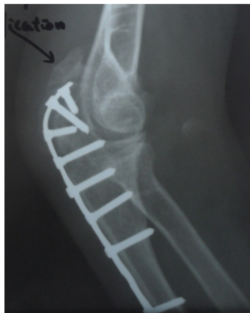
Figure 3: Occurrence of heterotopic ossification in the triceps muscle.

After resection of HO tissue, intraoperatively, we confirmed a full passive range of movement under