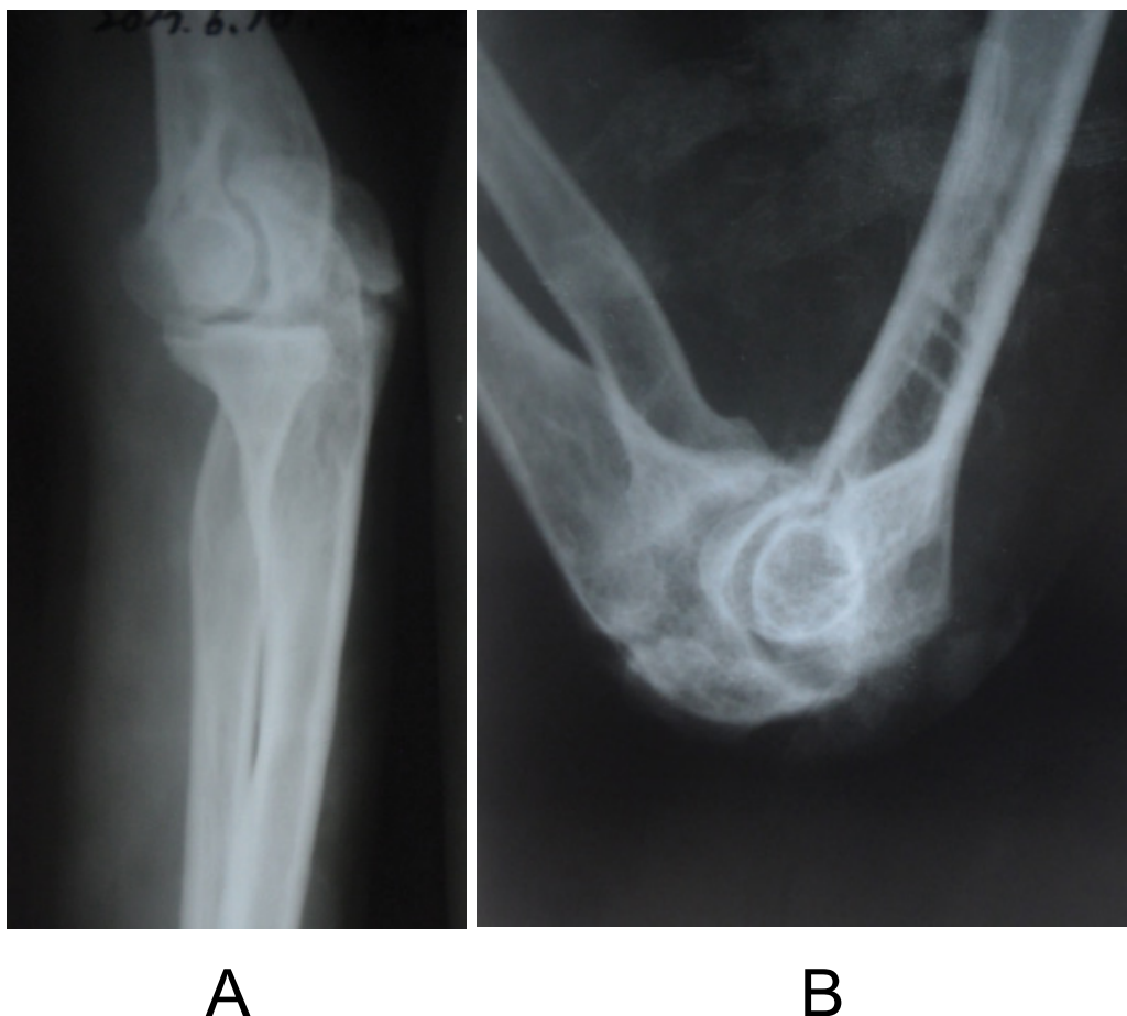
Figure 4: X-ray view of the elbow after removal of HO and implants (a) Lateral radiograph view of the extended elbow; (b) Lateral radiograph view of the flexed elbow.