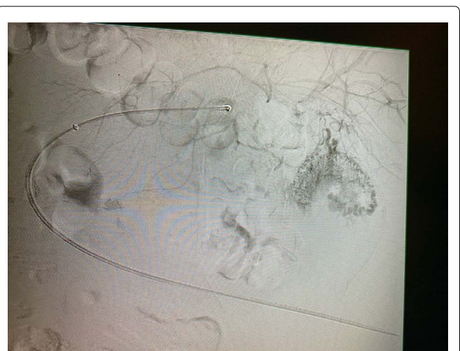
Appendix 3B: Angiogram.