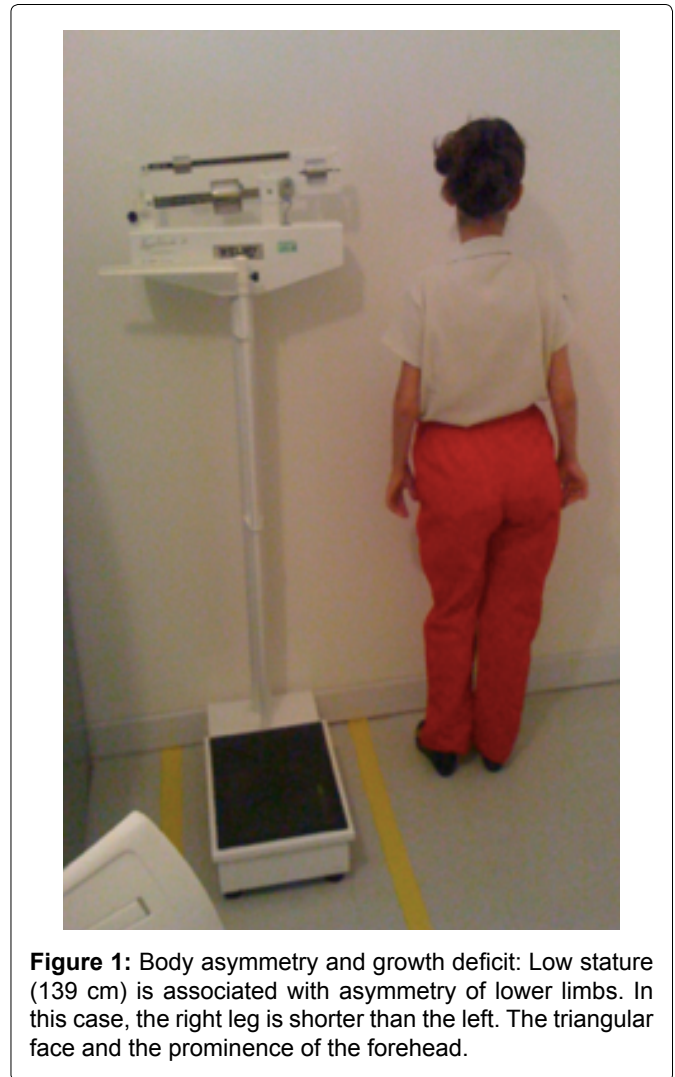
Figure 1: Body asymmetry and growth deficit: Low stature (139 cm) is associated with asymmetry of lower limbs. In this case, the right leg is shorter than the left. The triangular face and the prominence of the forehead.

The major problem of SSR is the body asymmetry and short stature that can determine obstetric complications for vaginal delivery. Cephalopelvic disproportion (CPD) is believed to occur due to short stature and narrow pelvis. Maternal height below 155 cm (61.02 in) has been considered an obstetric risk factor for dystocia and evolution for cesarean section. A study carried out in Thailand, considering a cut of 145 cm, found that short stature was significantly associated with a higher rate of CPD (OR = 2.4; CI = 1.8-3.0), even controlling variables such as birth weight, parity and obstetric care [4]. However, other studies have not verified a higher frequency of PWD in low-height parturients, and some authors believe that maternal