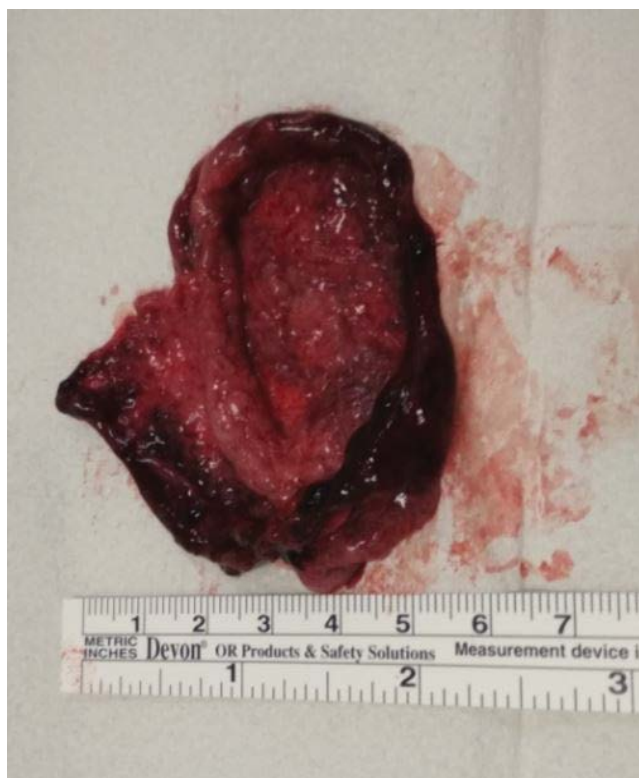
Figure 2: Decidual cast with the shape of the uterine cavity, resembling a gestational sac.

This is a case of an atypical presentation of Membranous Dysmenorrhoea (MD). Membranous Dysmenorrhoea, or passage of decidual cast is a rare event defined as sudden sloughing of thick endometrium as a whole with the shape of the uterine cavity, which may be associated with severe abdominal cramping, thus the name Dysmenorrhoea . There are few cases described, the great majority were in adolescents or young female adults who were on either combined or progesterone only contraceptive pill [1-4]. Its exact pathophysiology is unknown. It is believed to be related to the use of exogenous progesterone, as this hormone is the