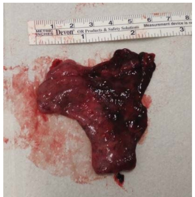
Figure 1: Decidual cast with the shape of the uterine cavity, resembling a gestational sac.

This was the first episode and the patient had no symptoms other than a sudden loss of a heterogeneous mass with 45 × 58 mm resembling a gestational sac,