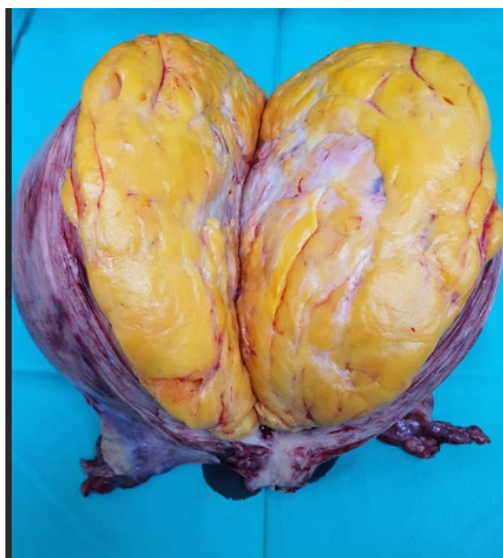
Figure 2: Cut section of intramural firm fibro-fatty mass.