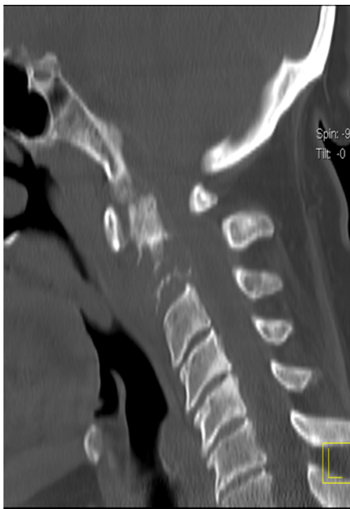
Figure 2: Computerized Tomography of cervical spine showing osteolytic lesion of axis body and atlantoaxial dislocation. Increase of atlanto dental space is also seen.

for tumours of the axis, and only two were metastatic [8]. Shin, et al. reported 51 cases of CVJ tumours, and only three were found to be metastatic [9]. However, tumours producing bone destruction commonly cause instability of the cervical spine. In the series reported by Piper and Menezes, eight of 14 patients presented with instability of the cervical spine [8], which was also seen in our patient.