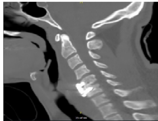
Figure 2: Postoperative CT scan showing spinal cord decompression following surgical discectomy and anterior arthrodesis of C5 - C6 vertebrae. CT scan = Computerized tomography scan.

After the patient was placed under general anesthesia, electrodes were placed for motor-evoked potential and somatosensory-evoked potentials. Baseline potentials were then obtained and remained stable throughout the entire procedure. A transverse right anterior neck incision was made at the C5-C6 level, confirmed by intraoperative X-ray. Once appropriate anatomical structures were divided and retracted, a large disc fragment was encountered between C5-C6 and removed below the Posterior Longitudinal Ligament (PLL). Decompression was then confirmed with a nerve hook. A 6 mm cadaveric structural allograft was then sized and