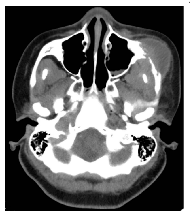
Figure 3: CT neck with contrast performed at follow-up demonstrating progression of findings related to osteomyelitis of the left zygoma with inflammation of the left subperiosteal inferotemporal orbit and left anterior masticator space, as well as left maxillary sinusitis and left parotid lymphadenopathy.

were no signs of any periorbital swelling and no difficulty with eye movement; her CRP was downtrending as well. She was discharged home with Clindamycin and instructed to follow-up in one week.