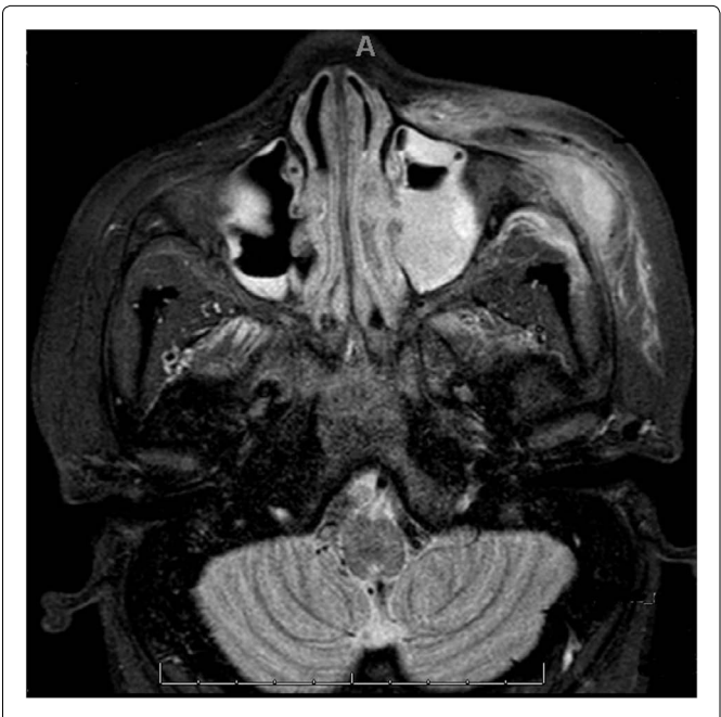
Figure 2: MRI orbits with and without contrast demonstrating a 2.0 \times 1.4 \times 1.6 cm loculated fluid collection in the left facial soft tissues with soft tissue swelling, edema, and fat stranding suggestive of infection extending to the left cheek and left preseptal and periorbital soft tissues. There is also pathologic replacement of the normal fatty marrow of the adjacent left zygomatic arch, left zygoma, and lateral wall of the left orbit suggestive of osteomyelitis. There is bilateral maxillary sinusitis noted, left more severe than right.

were no signs of any periorbital swelling and no difficulty with eye movement; her CRP was downtrending as well. She was discharged home with Clindamycin and instructed to follow-up in one week.