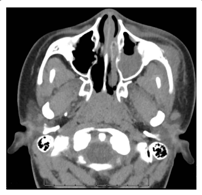
Figure 1: CT maxillofacial without contrast on initial presentation demonstrating a soft tissue density with surrounding fat stranding in the left facial soft tissues measuring 2.7 \times 1.3 \times 3.8 cm, consistent with abscess. There is also lucency, permeated texture, and a periosteal reaction of the leftzygoma and zygomatic arch adjacent to this region suggestive of osteomyelitis.

DOI: 10.23937/2572-4193.1510087 ISSN: 2572-4193