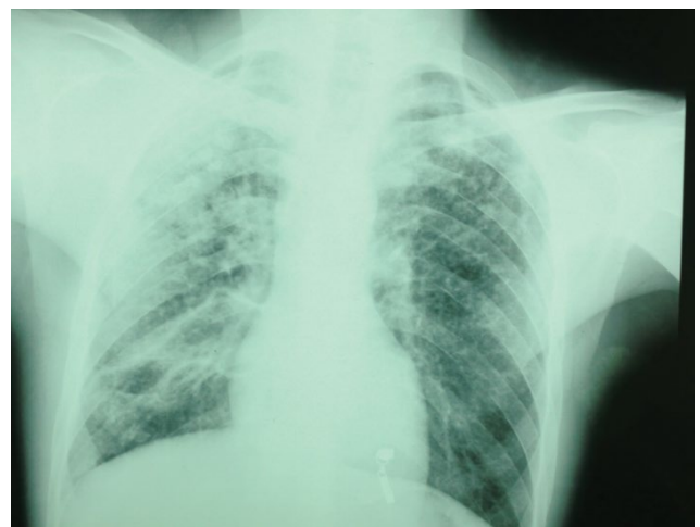
Figure 1: Chest radiography revealed wide spread nodular opacities distributed throughout both lungs.

Clinical examination revealed, in nasofibroscope, tumor in the larynx. There was no neck stiffness or enlarged lymph nodes or signs of meningeal irritation or localising neurological deficit. Chest