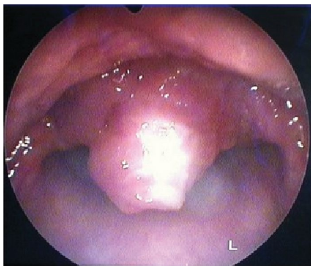
Figure 4: Nasofibroscope showing tumor of epiglottis.