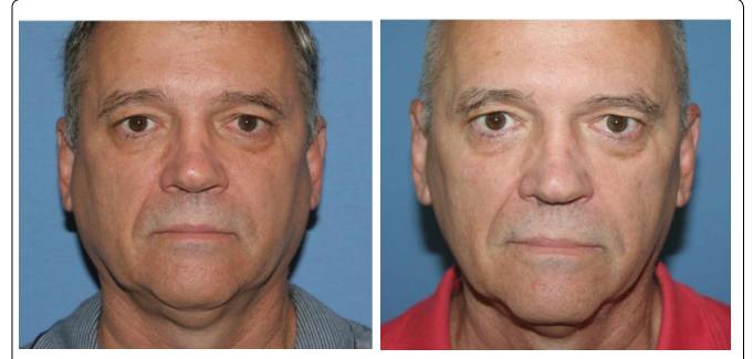
Figure 5: Pre operative (a) and post operative (b) photos after left piriform margin augmentation (PMA).

airway improvement as late as one year after surgery. The use of titanium and high-density porous polyethylene (Medpor) in the midface is common in traumatic and oncologic reconstruction, but the authors are not aware that alloplastic augmentation of the piriform margin has been advocated previously for nasal airway benefit. The present work illustrates a method for treating persistent nasal valve dysfunction via a sublabial approach, thereby avoiding revision rhinoplasty. It does not rely on a suture suspension technique that could break, stretch, or pull through tissue, losing effectiveness over time, but rather elevates the position of the bony piriform margin at the location of the internal nasal valve via a customized, bone anchored, alloplastic material. This method may also prove applicable to treat patients with nasal obstruction caused by facial nerve paralysis or partial maxillectomy. This research underscores the importance of the piriform margin as an integral component of the nasal valve mechanism and describes a potential salvage technique for patients who suffer from persistent symptoms of obstruction associated with unilateral internal nasal valve dysfunction after undergoing functional septorhinoplasty.