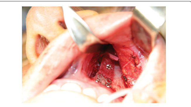
Figure 3: Intraoperative view of the modified Titan implant, fixated to the left piriform margin.

All study patients could feel the implant with direct palpation, but only 1/8 reported direct palpation to be bothersome. 7/8 reported no