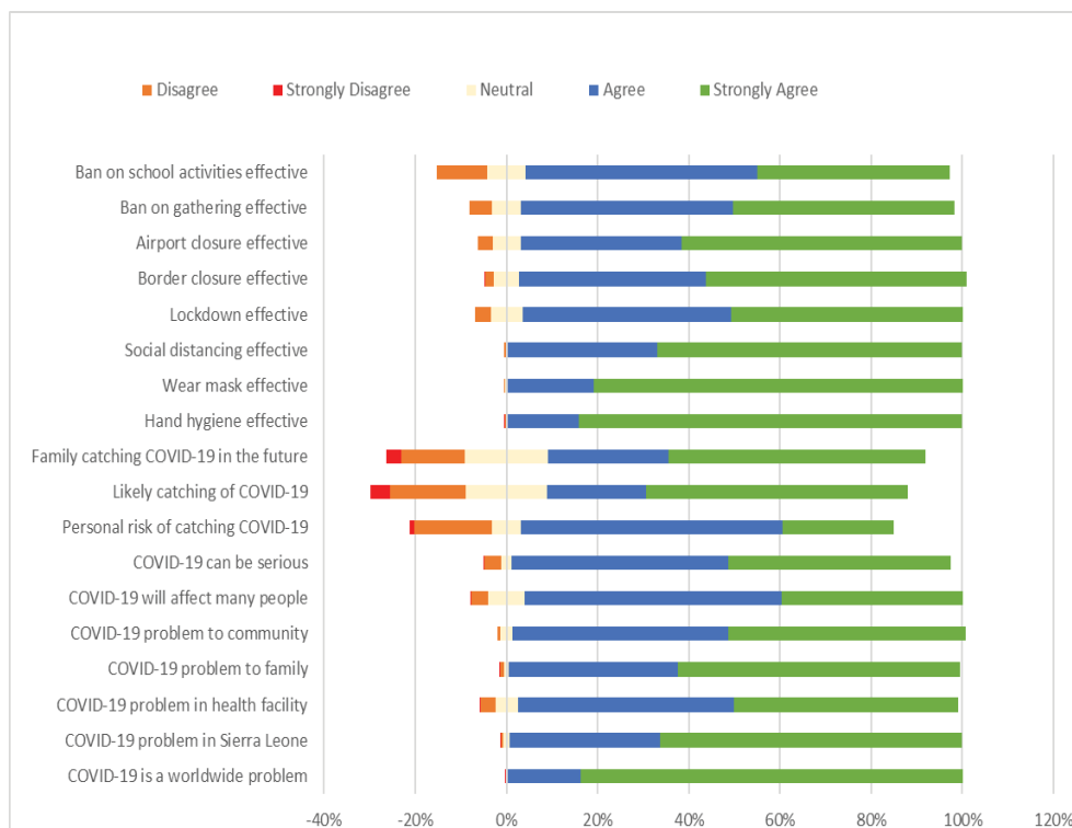
Figure 3: Risk perception of health care workers in Sierra Leone, 2020.