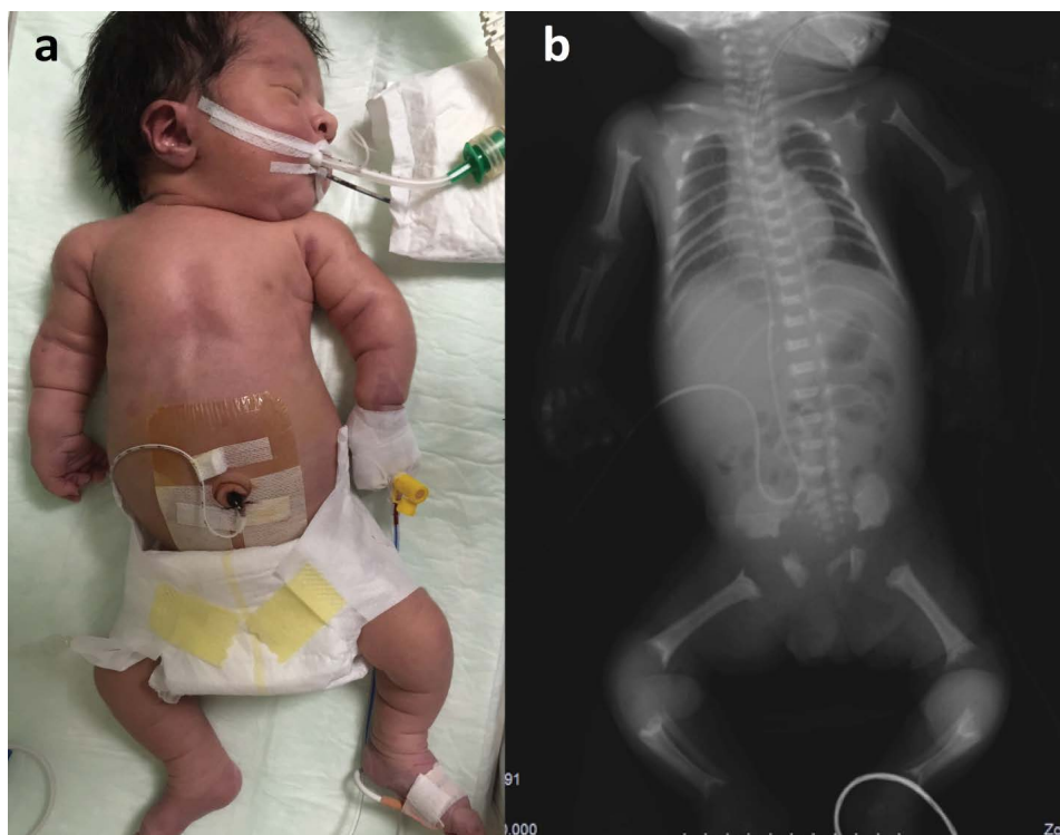
Figure 1: General appearance (a) and radiograph (b) of case. Note that rhizomelic shortening of all four limbs, and redundant skin folds in the limbs (a). Short long bones, widening and cupping of metaphyses of all bones in the extremities, platyspondyly, ribs cupped anteriorly and posteriorly, flat acetabular roof, decreased sacrosciatic notch, small hypoplastic iliac bones, and disproportionately long fibulae are seen on radiograph (b).