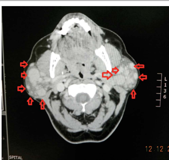
Figure 2: Computed tomography scan (no contrast). Significant bilateral parotid enlargements with increased glandular density (red triangles).