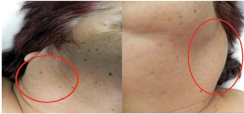
Figure 1: Preoperative view of the patient showing the mass over the right and left parotids.