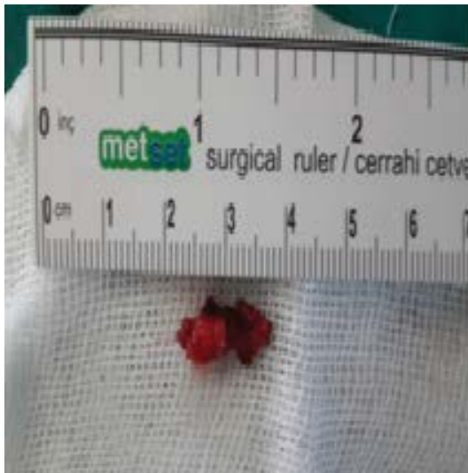
Figure 8: Pilonidal sinus excised from the back of the third finger.