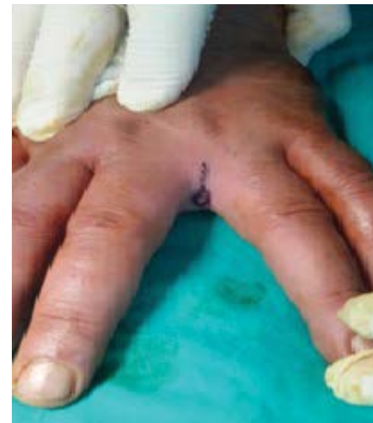
Figure 6: Determining the incision line.

blue to intraoperatively determine the resection site [29,32] (Figure 5 and Figure 6). In addition, fistulography may be useful to determine the surgical boundaries in complicated cases of a fistula or when the margins cannot be detected by traditional approaches [29].