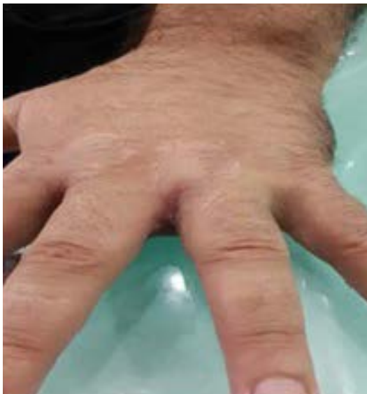
Figure 12: Appearance of excised region 4 months after operation.

developed. Moreover, new lesions developed in our patient on parts of the hand that were different from the excised areas. In other words, unique IPSD developed in the patient each time, and no recurrence was observed. Granulation tissue that develops in the wound during the postoperative period eventually becomes scar tissue containing inactive fibroblasts, intensive collagen fibrils, elastic tissue fragments, extracellular matrix, and a few vessels [60]. Hair and feathers cannot easily penetrate scar tissue that develops in interdigital spaces. Thus, the formation of scar tissue after surgery may explain the development of the disease in different parts of the hand.