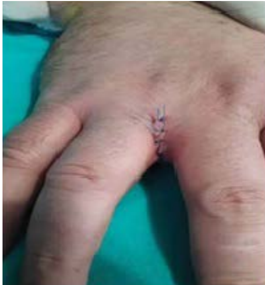
Figure 11: Appearance of wound area after primary.