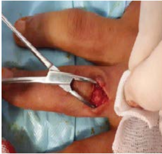
Figure 7: Pilonidal cyst in the back of the third finger.