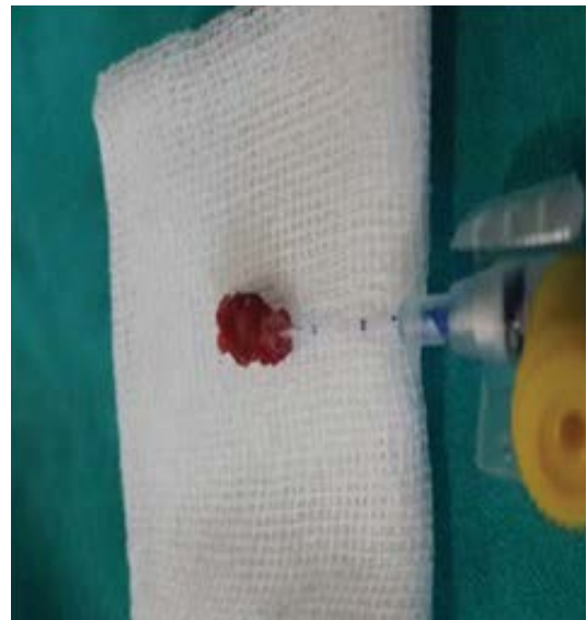
Figure 10: Pilonidal sinus excised from the interdigital space.

et al. proposed that IPSD can be completely treated by removing embedded hair [49].