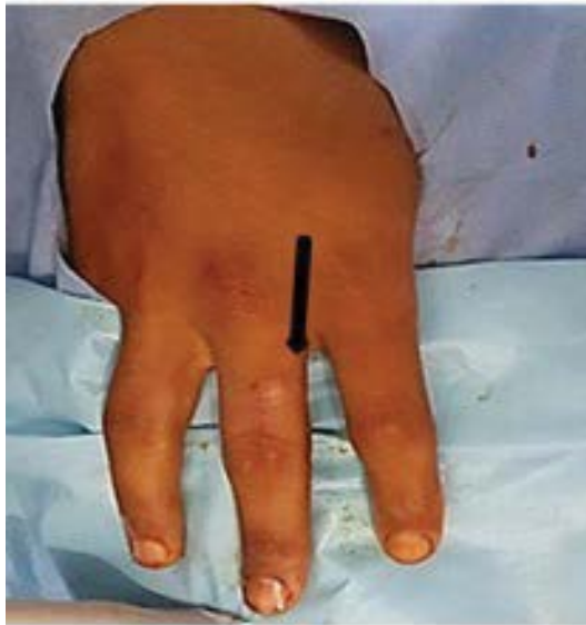
Figure 3: Pilonidal cyst on the dorsal side of the third finger.