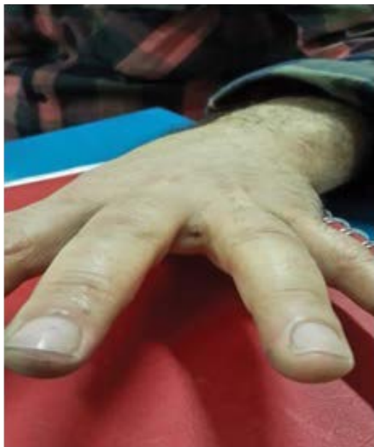
Figure 4: Interdigital pilonidal sinus disease in the third interdigital space of the left hand.