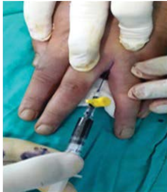
Figure 5: Methylene blue injection into the cyst cavity during the operation.