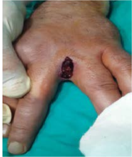
Figure 9: Appearance of the interdigital space after excision.