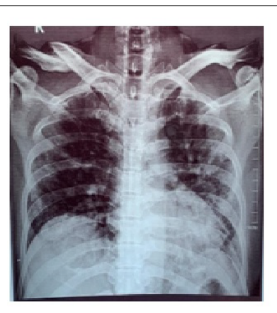
Figure 1: Thorax X-ray results in before transferred to high care unit (HCU) and after 21 days in treatment.