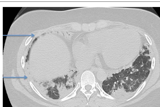
Figure 1: Representative image of Lung Tip consolidation. Arrow indicates two thick consolidation and migratory birds sign.

We described diagnosis of DM and DM-specific clinical signs such as Gottron sign and subungual erythema were strong predictors of