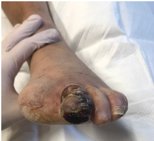
Figure 1: Gangrenous second toe on initial presentation.