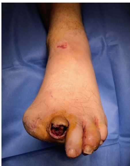
Figure 2: Guillotine amputation of left second toe.

time or swing phase time compared to non-amputees [13].