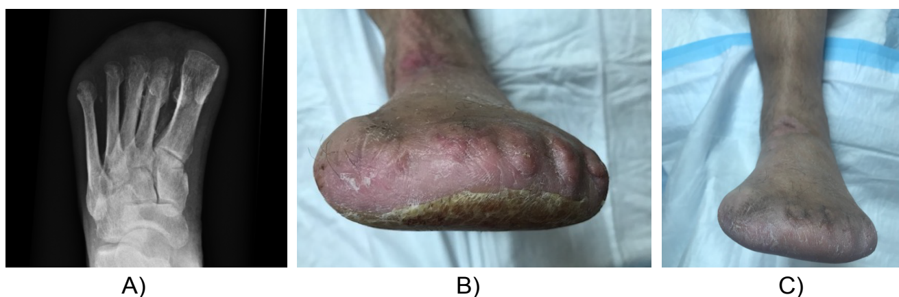
Figure 5 (A-C): Radiographs and clinical photos 9 months after final closure.