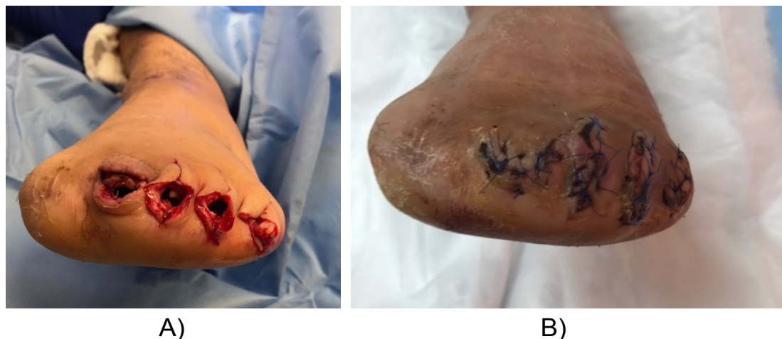
Figure 4: A) Pan digital amputation after disarticulation of all lesser toes; B) Final closure of the amputation.