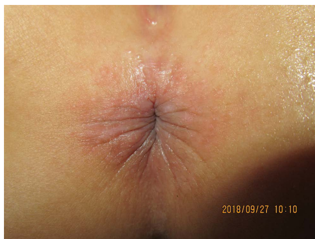
Figure 3: a,b) After the first stage of wart wound healing of Petrin.