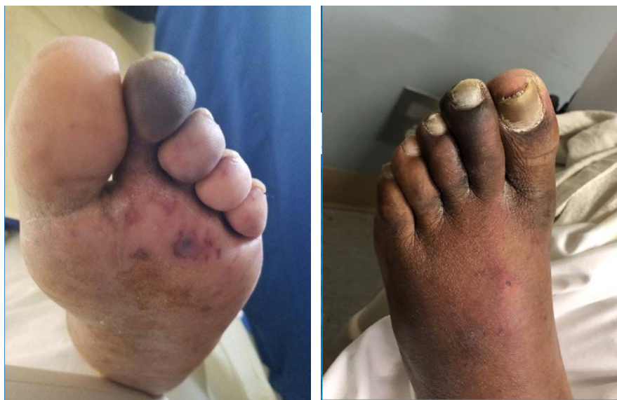
Figure 1: Ischemic foot.

requiring right carotid to carotid and carotid to left subclavian bypass. One month later, he underwent surgery for a type II endoleak complicated by left iliac artery occlusion requiring a fem-fem bypass. The patient was discharged and was stable and very functional for the past five years until the current presentation of acute symptoms.