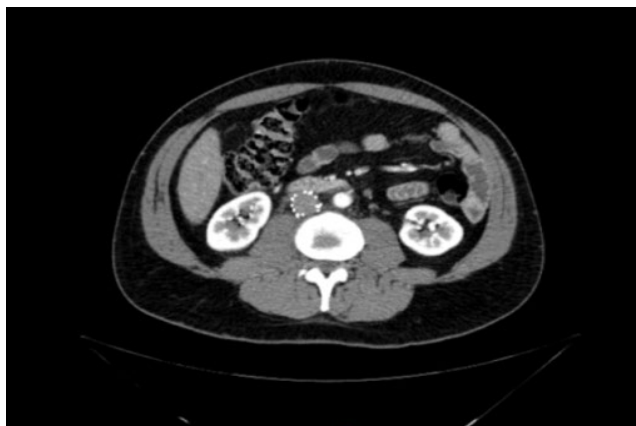
Figure 2: It shows the vena cava filter and thrombus that extend by.

thrombectomy of iliac veins and lower vena cava and intravascular ultrasound (IVUS) of iliac veins and lower vena cava (15/11/21) (Figure 4a and Figure 4b).