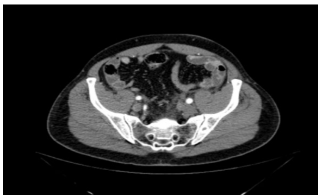
Figure 3: Involvement of both iliac and femoral veins.

During hospitalization, an echocardiogram is done, which reports a well-closed foramen ovale without data of pulmonary hypertension; the rest are normal.