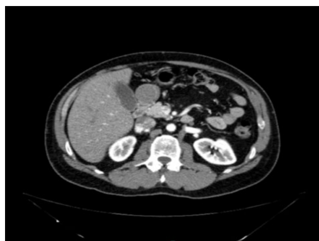
Figure 1: A thrombus that extends from the lower vena cava shows a vena cava filter.

Report of bilateral ascendent phlebography, venous