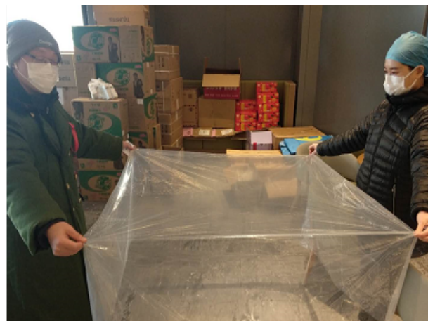
Figure 4: Customized large and transparent plastic shield.

Large and transparent plastic shield: It is with applying the large and completely transparent plastic shield, which covered the upper part of head and body of the patient (normally of 70 cm × 70 cm in size). High concentration oxygen flow supply by mask, pressure ventilation, endotracheal intubation, sputum suction, etc. can be carried out under the transparent plastic shield. By blocking the transmission route, this cheap plastic shield can be used to prevent accidentally contact of the splashed secretion, droplets, aerosols, etc., at the same time, reducing the contaminant of the environment, and greatly improving the safety of such procedures (Figure 3, Figure 4 and Figure 5).