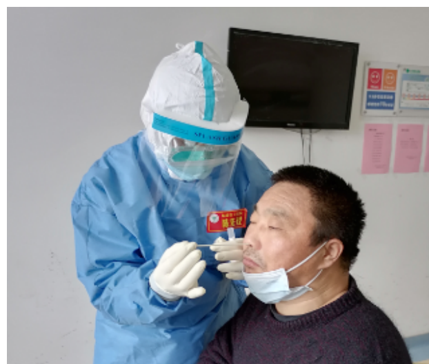
Figure 9: The application of three-level protective measures.

For those with positive pressure head shield: