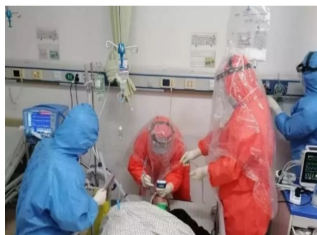
Figure 10: Plastic head shield made by Fujian Union Hospital.