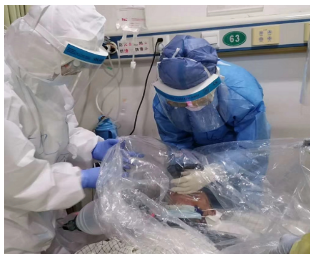
Figure 5: These pictures are captured on site when performing tracheal intubation, the same as pressure oxygen supply or sputum suction can be done under the plastic shield.