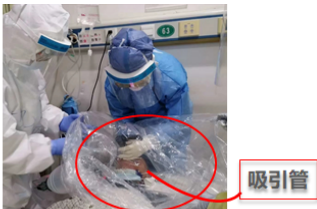
Figure 8: Suction pipe instantly remove the aerosol from the surrounding of the mask.