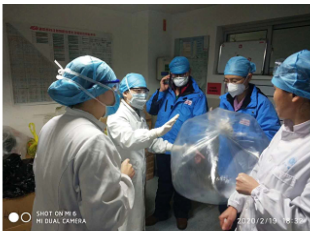
Figure 3: On hand materials in the ward (large transparent plastic bag).

alcohol is used instead, which has stronger isolation and protection effect, especially for patients who need to receive pressure ventilation (Figure 2).