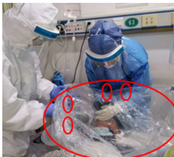
Figure 6: A marked red circle around the peripheral shall be pasted with double-sided adhesive tape to form the relatively closed operation space.