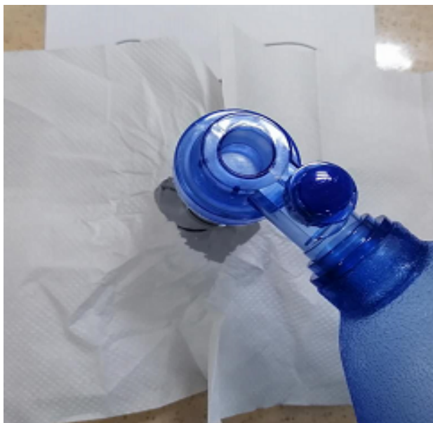
Figure 2: Multi-layers gauze damped with saline or 70% alcohol has covered the outer of the mask.