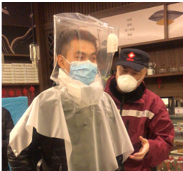
Figure 11: Positive pressure head shield from another medical team.

(1) Personal three-level protection + positive pressure head shield