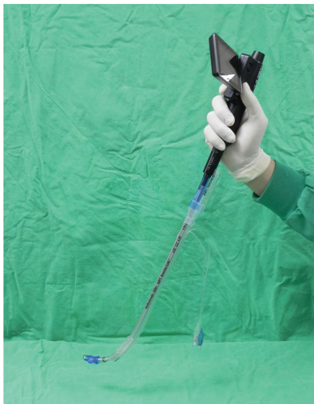
Figure 1: The assembly of Trachway® intubating stylet and left-sided double-lumen endobronchial tube.