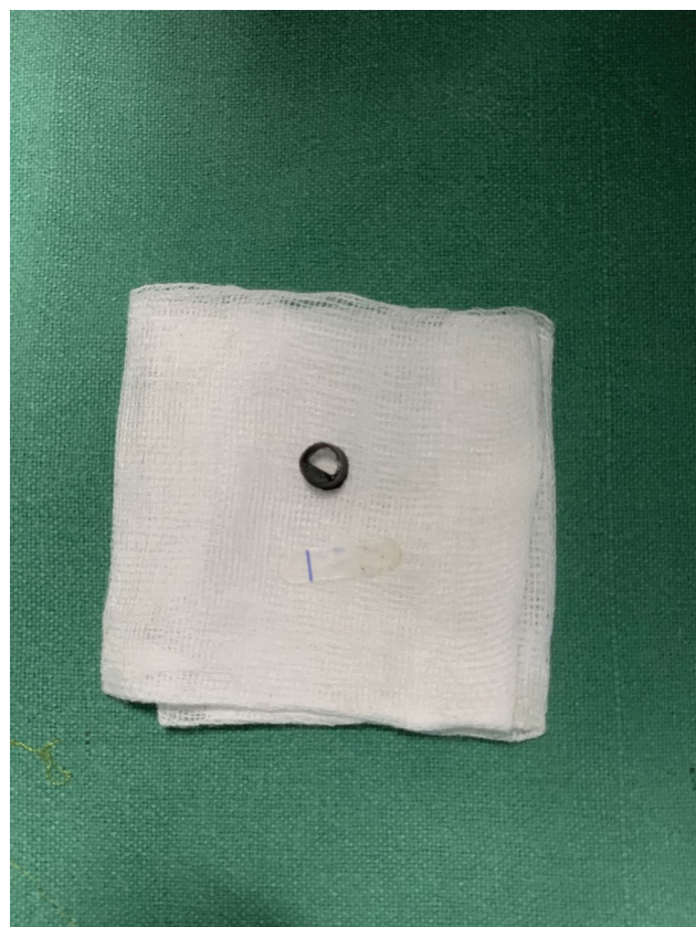
Figure 2: Foreign body.

or symptoms of upper respiratory tract infection. The physical examination was within normal limit except for whistling sound during each inspiration (Video 1). The parents reported that he had accidentally inhaled the foreign body while playing. Radiography of the chest revealed the presence of round shaped foreign body in the trachea probably in the subglottic area of larynx (Figure 1). Anesthesia was induced with sevoflurane in oxygen while maintaining spontaneous respiration. After achieving adequate depth of anesthesia, rigid bronchoscope was placed and non-depolarizing muscle relaxant (atracurium) was given to prevent patient movement, reflex and airway trauma. Stable depth of anesthesia was maintained during the procedure by using infusion of propofol. A rigid bronchoscopy was done and a whistle (Figure 2) was retrieved from right main bronchus. The procedure was uneventful and the child is doing well at 3 years follow up.