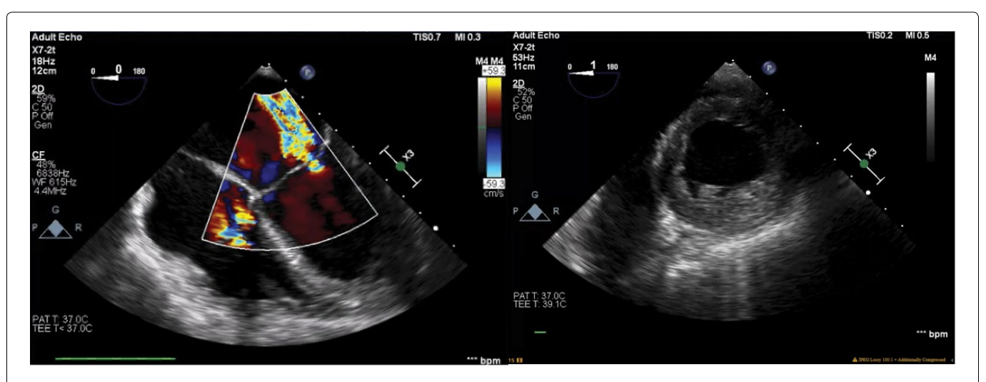
Figure 1: Transesophageal echocardiogram was performed intraoperatively, revealing 2+ mitral valve regurgitation, left ventricle ejection fraction of 25%, akinetic septum, and hypokinetic anterior and inferior left ventricular walls. There was also moderate aortic insufficiency.