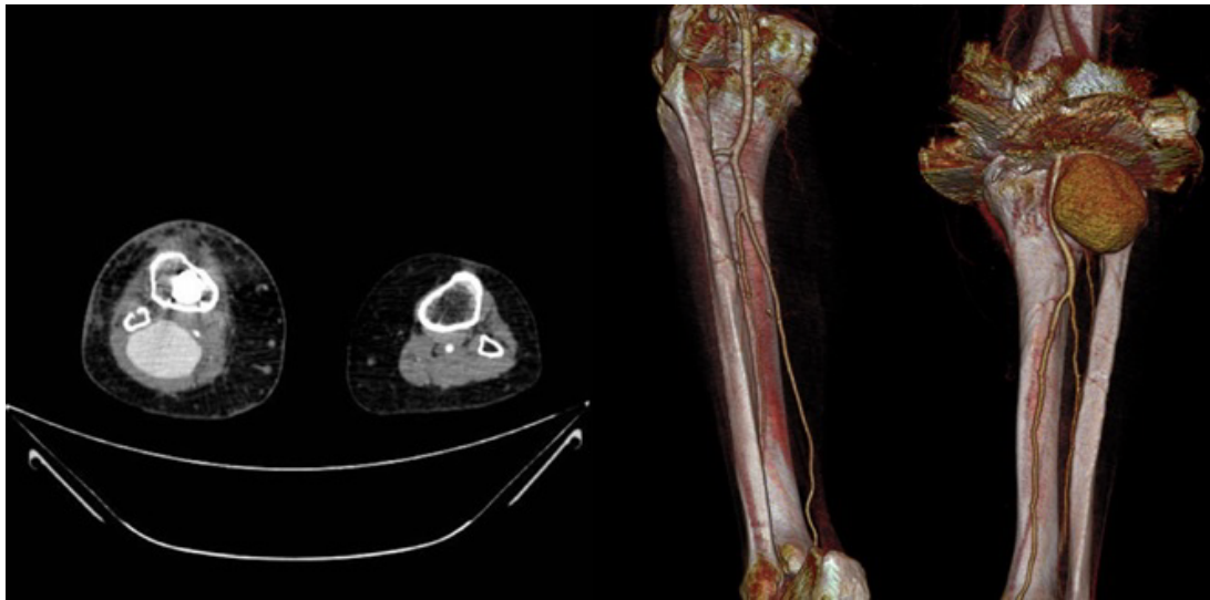
Figure 1: CT angiography image and 3D reconstruction showing the popliteal artery pseudoaneurysm.