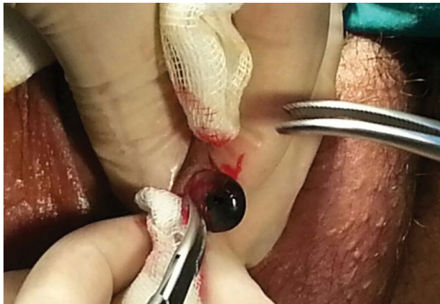
Figure 2: Extraction of stone.