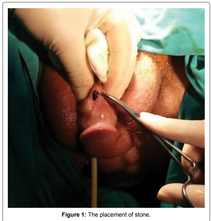
Figure 1: The placement of stone.

A 69-year-old circumcised male patient, previously diagnosed with ureteral stone, was referred to our urology clinic for ureteral stone removal. During his physical examination three stony hard, mobile, smooth nodules, located at the dorsum of the penis were noticed. These nodules were approximately 1 cm in dimension, located within the coronal sulcus, at 11, 12, 1 o'clock positions