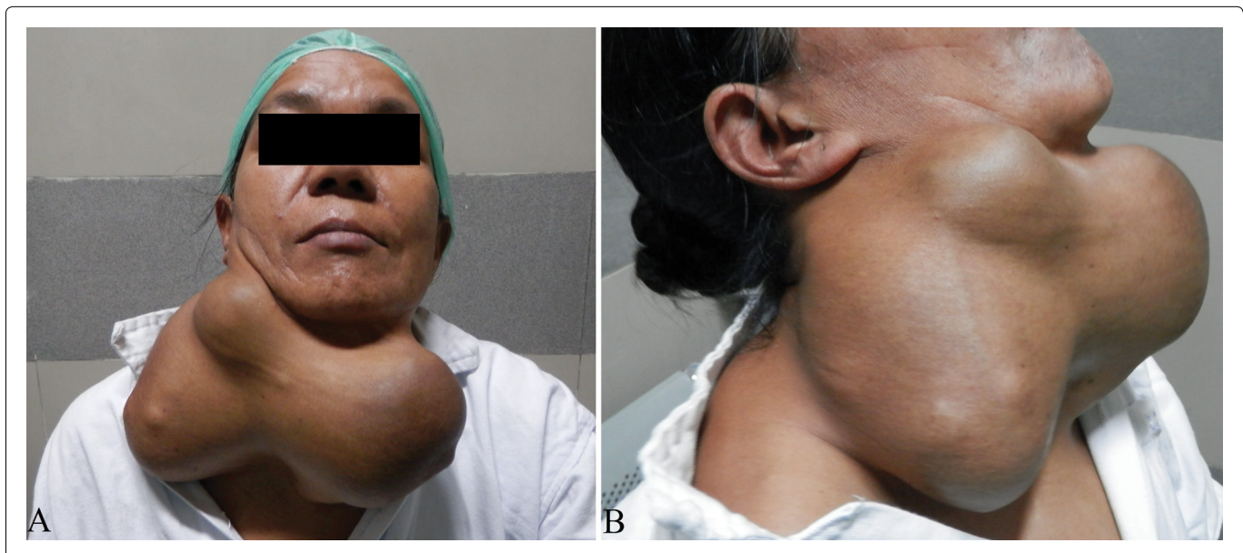
Figure 1: A large irregular swelling in the front (A) and sides (B) of the neck.

uniform diffuse enlargement of the thyroid gland; right lobe being more enlarged than the left lobe. The surface was nodular, hard in consistency, moving up and down with deglutition, mobile and not fixed to the skin and underlying structures. There were no signs of toxicity. Multiple lymph nodes were palpable in the right deep cervical group at levels II and III. The lymph nodes were firm in consistency and mobile. Systemic examination was normal. Investigations suggested a diagnosis of papillary carcinoma of thyroid and a surgical excision was performed. Histopathology confirmed the diagnosis of papillary carcinoma of thyroid (Figure 2).