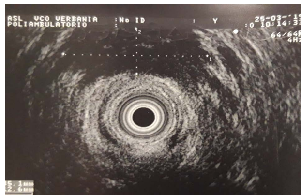
Figure 3: Transanal ultrasonography: Confirmation of the presence of a deep anterior anal abscess outside the external anal sphincter.

The patient underwent to incision and drainage of the abscess; an underlying transsphincteric fistula was surrounded by a loose seton. The patient received antibiotics (Ceftriaxone and Metronidazole) and supple-