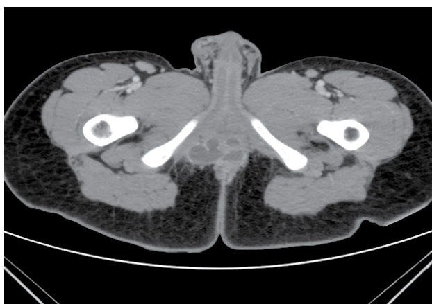
Figure 2: Computed tomography of the pelvis: Multiseptated abscess of the anterior perineum.

position), the clinical examination revealed an area of tenderness without evidence of fluctuating collection. The rectal exploration was very painful without detectable fluctuating collection in perianal area. No residual retracting scar or anal dysfunction were present. Laboratory analyses demonstrated increased inflammatory markers (neutrophilic leucocytosis, C-reactive protein, erythrocyte sedimentation rate) and increase in serum IgE levels (more than 5000 U/mL). Chest X-rays revealed two pneumonia, sited at the left pericardial area and superior lobe of the right lung (Figure 1). Computed tomography of the pelvis showed a multiseptated abscess of the anterior perineum (Figure 2). The patient received a proctologist valuation and underwent to a transanal ultrasonography which confirmed the presence of a deep anterior anal abscess outside the external anal sphincter (Figure 3).