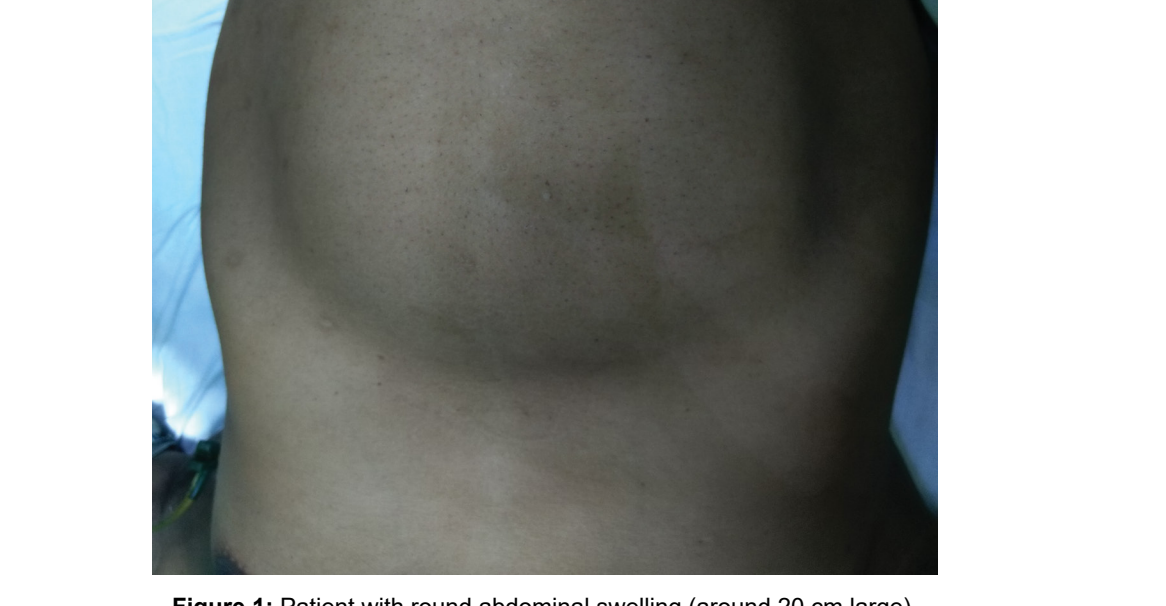
Figure 1: Patient with round abdominal swelling (around 20 cm large).

increased to its present size of around 20 cm (Figure 1). The swelling was accompanied with mild pain and discomfort, which increased with increase in size of the swelling. Clinical examination and radiological