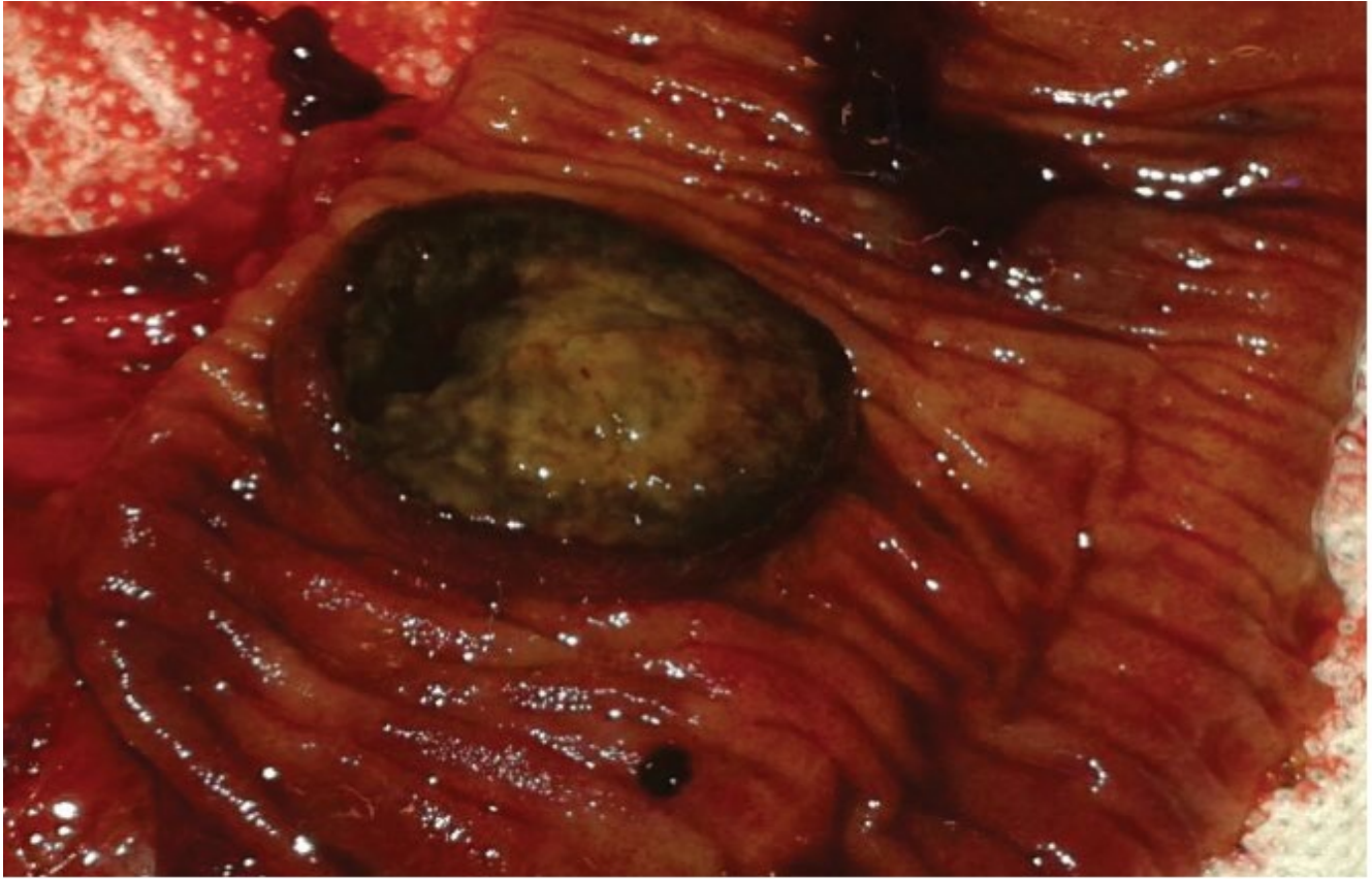
Figure 2: Ileo-cecal intussusception that was resected. Nodular lesion was found to have also an intramucosal infiltration.