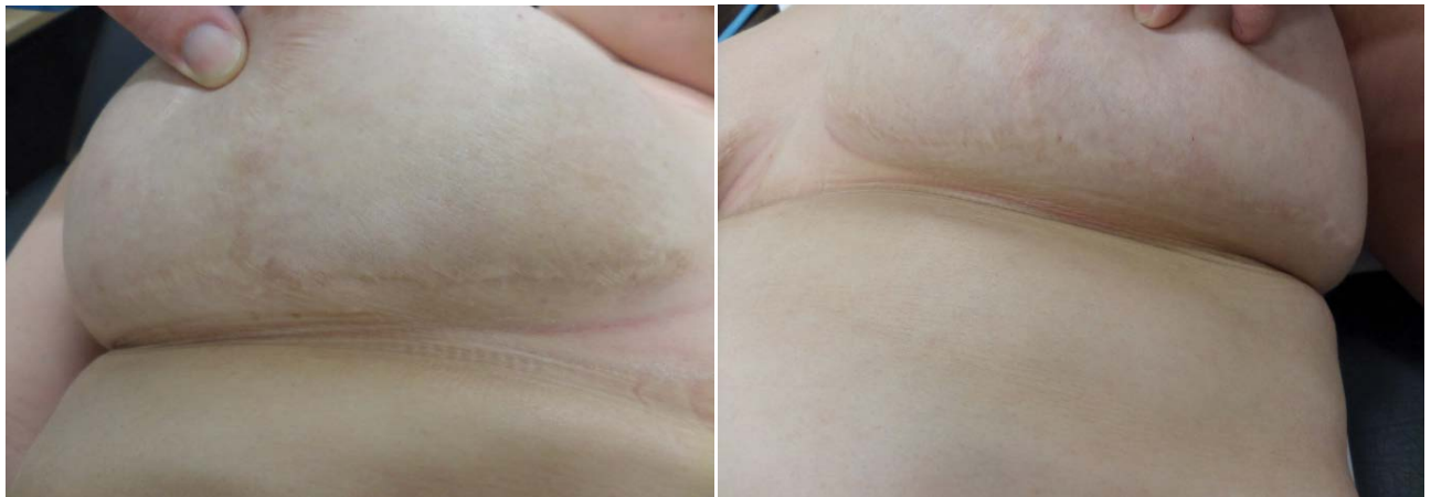
Figure 2: Shows postoperative appearance of the right and left patient's breast. The slightly darker coloured areas were treated with percutaneous scar release.