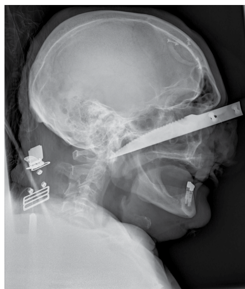
Figure 2: lateral view on X-ray showing a penetrating knife.

Because of the stable vital parameters we took the time to further investigate the knife's trajectory. A plain X-ray showed the knife's position, outside the neurocranium, with the tip extending just anterior of the first cervical vertebra (Figure 1 and Figure 2). To gain additional information regarding the structures in the face and the exact positioning of the knife a complementary enhanced CT scan with intravenous contrast was made (Figure 3). This scan showed the knife penetrating from the medial side of the orbita, along the