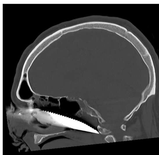
Figure 3: Lateral view on cerebral CT.