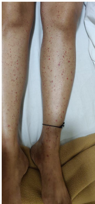
Figure 1: Papular lesions on both the lower limbs.