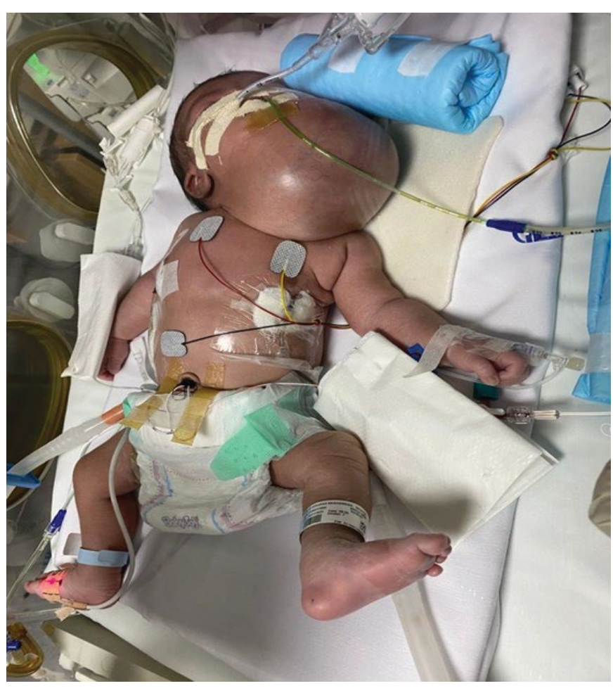
Figure 2: The baby in the NICU incubator after delivery.

DOI: 10.23937/2377-4630/1410177 ISSN: 2377-4630