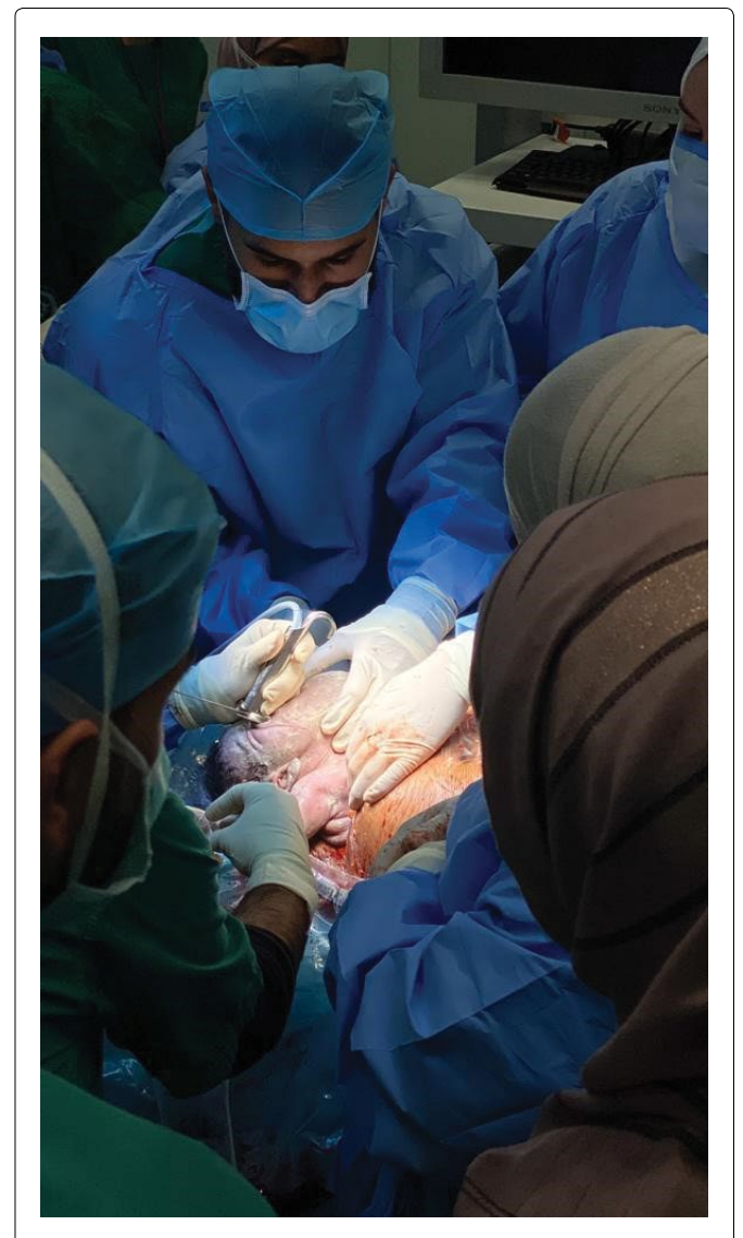
Figure 1: Intubating the baby while the head, neck, and right arm were extracted from the uterus.

After the Lower uterine segment incision only the infant's head and neck were pulled out carefully with the right arm. During the procedure, the rest of the infant's body remained inside the uterus. The anesthesia team applied a sterile pulse oximeter device to the dorsum of the infant's right hand, and the neonatal anesthetist administered atropine 100 mcg and ketamine 4 mg intramuscularly to facilitate intubation before clamping the cord. On the other hand, the neonatal anesthetist, the neonatologist, and the otolaryngologist prepared a rigid scope size 2.7 mm and ETT size 3.0 shaped with stylite, with different types of intubation devices ready if rigid scope intubation failed. However, the ETT was